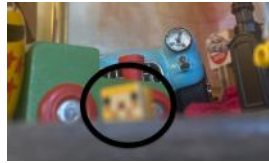
A NEW COMPUTER CREATURE IN BINGO