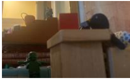
EMPEROR BLUE EYES AT HIS DESK, PREPARING TO LEAVE BINGO