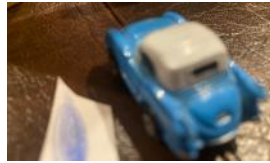
OFFICER KELP'S CAR DRIVING TO FORTRESS MOONBEAM