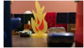
THE UNICORN HAS LIT A FIRE IN FORTRESS MOONBEAM